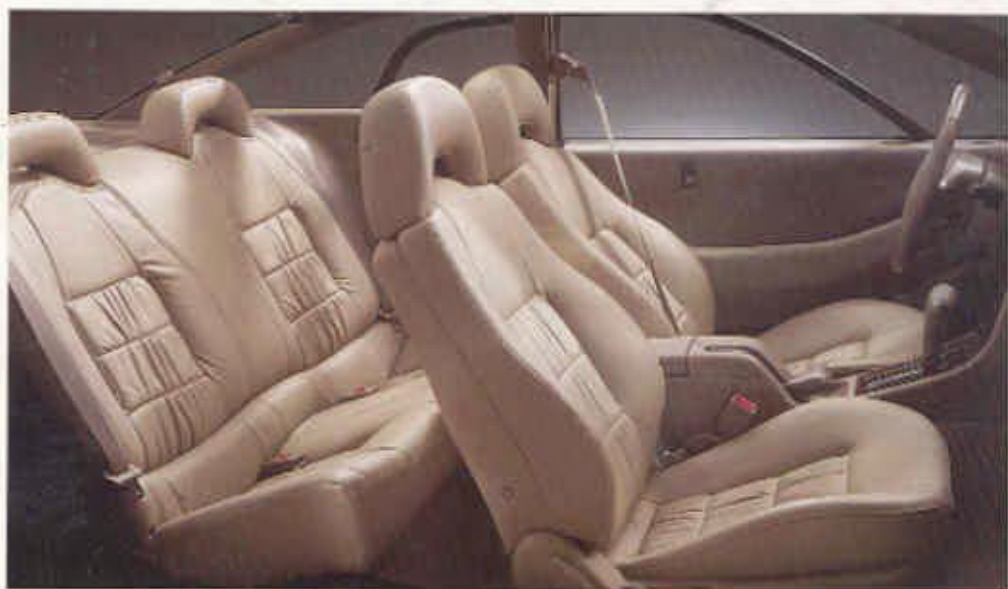
Press powergate automatic shoulder strap seat belts to clearly display. All buckles and lap belts should be connected and used.